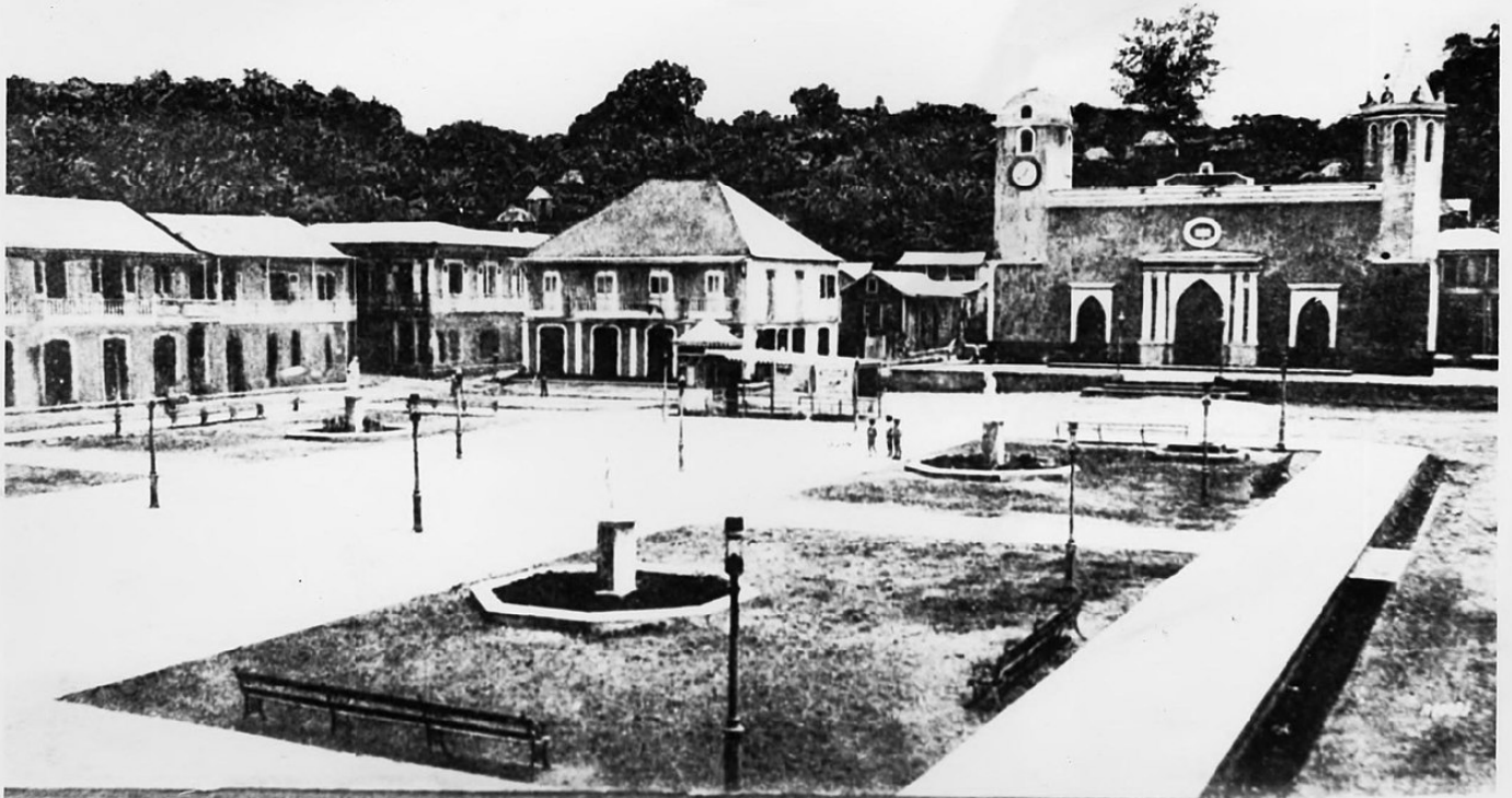
Aguadilla Plaza, Puerto Rico.

Approximately 475 rebels were imprisoned, including Manuel Rojas. On November 17, 1868, a military court imposed the death penalty for treason and sedition on all prisoners — a sentence that would have been historically catastrophic if executed. The incoming governor José Laureano Sanz dictated a general amnesty early in 1869, and all prisoners were released. This amnesty, combined with contemporaneous political