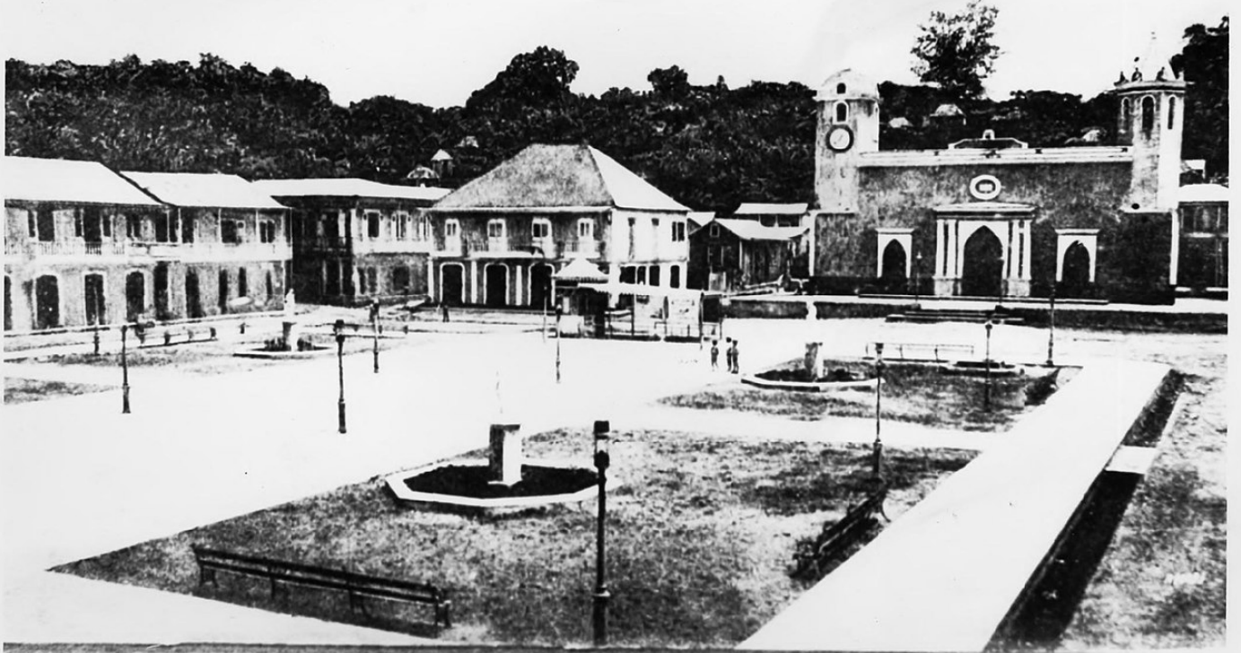
Aguadilla Plaza, Puerto Rico.